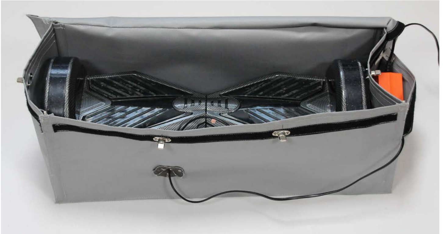
Safe pocket for a hoverboard charger

You've probably seen it yourself on many news channels, how dangerous hoverboards can be. Whilst providing some serious adrenaline rush and a huge dose of fun during their use, after going home you don't want to stay alert all the time thinking what's going to happen to your hoverboard whilst charging.